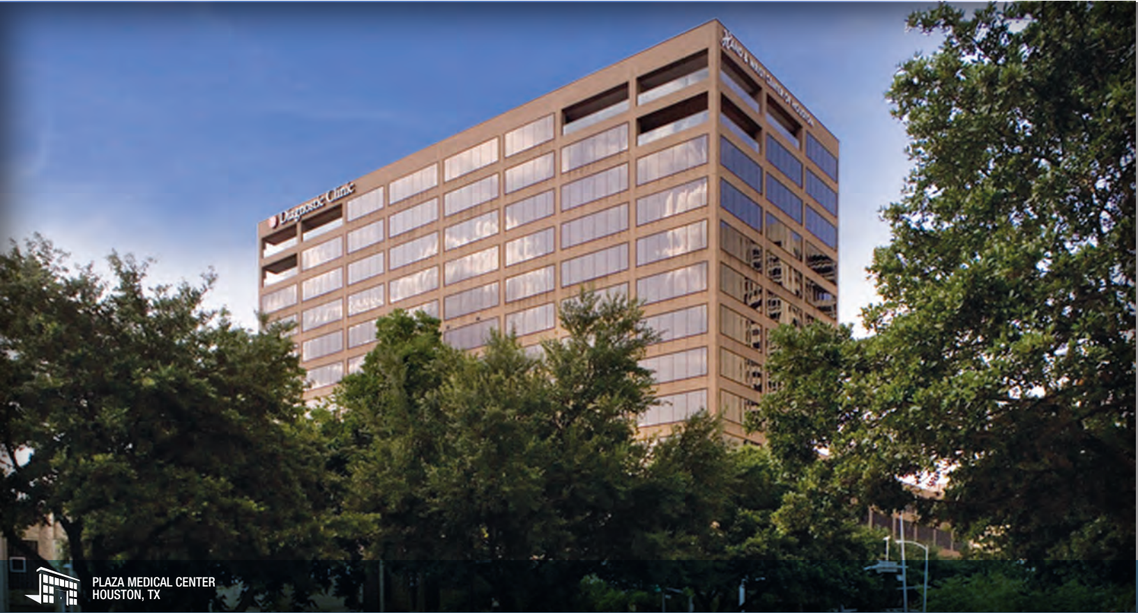
PLAZA MEDICAL CENTER HOUSTON, TX