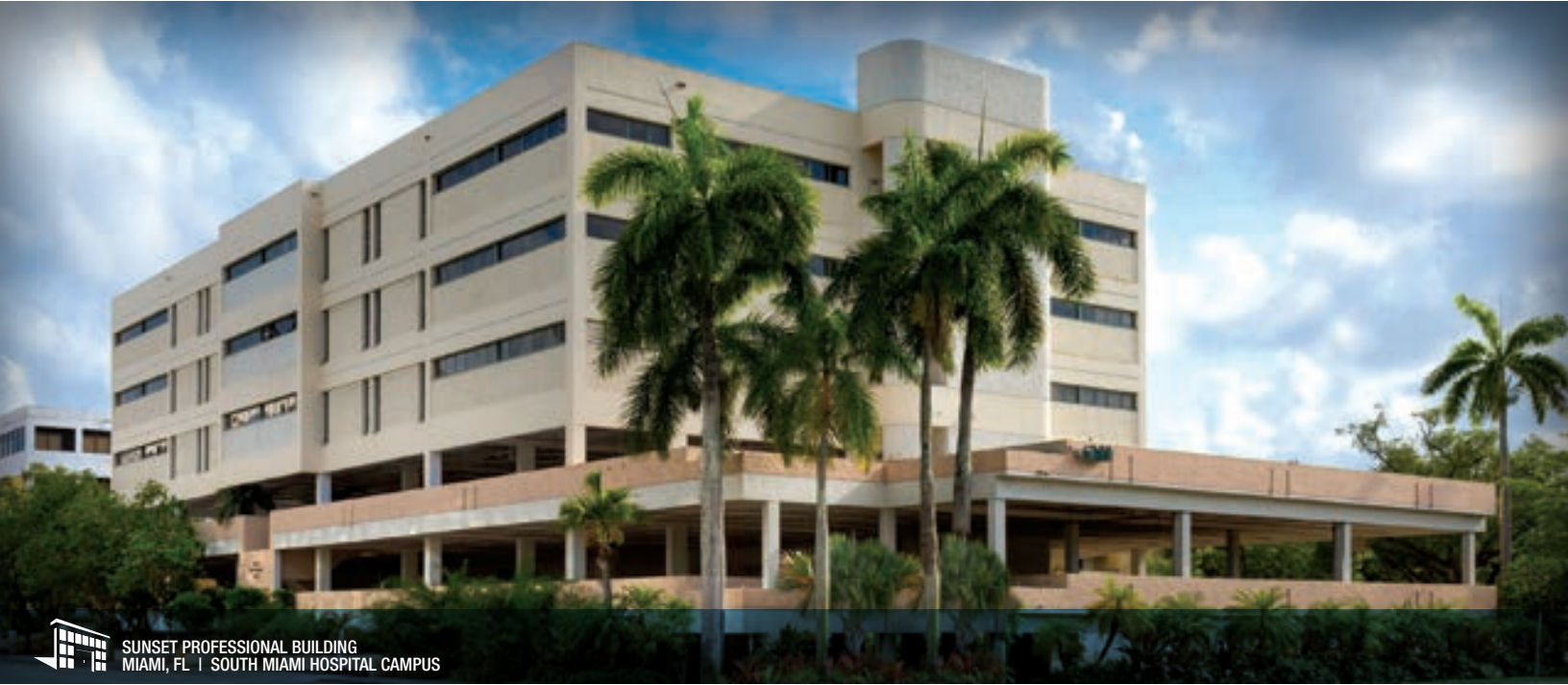
SUNSET PROFESSIONAL BUILDING MIAMI, FL | SOUTH MIAMI HOSPITAL CAMPUS