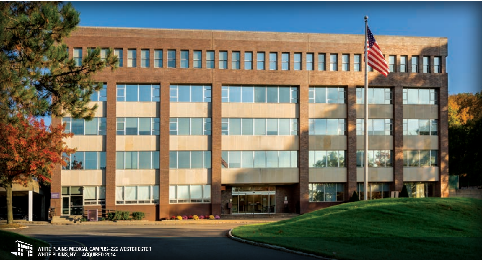
WHITE PLAINS MEDICAL CAMPUS—222 WESTCHESTER WHITE PLAINS, NY | ACQUIRED 2014