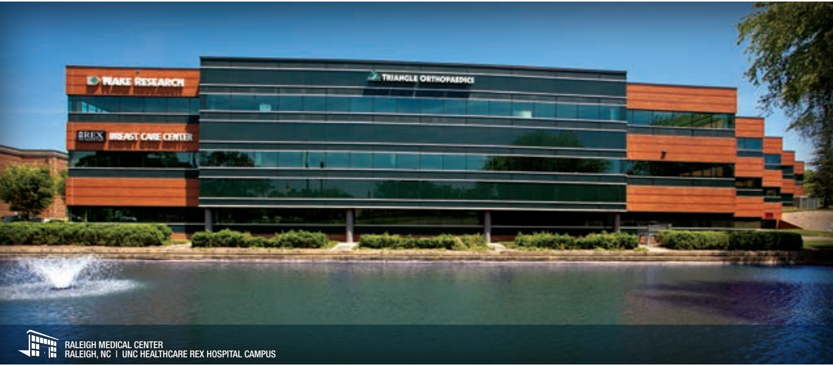
RALEIGH MEDICAL CENTER RALEIGH, NC | UNC HEALTHCARE REX HOSPITAL CAMPUS